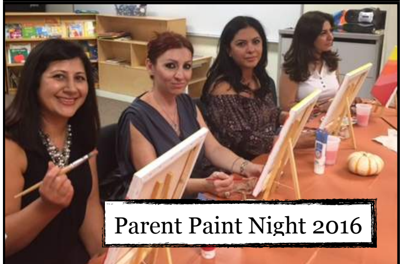
Parent Paint Night 2016