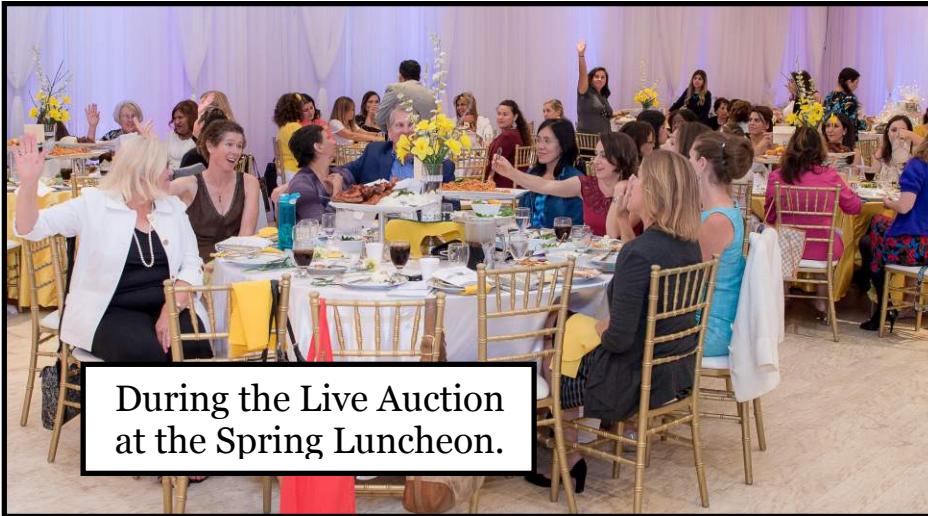
During the Live Auction at the Spring Luncheon.

As students, and members, you all have a "say!" If you're interested in joining the board, please come to one of our Association Meetings, which is usually the first Wednesday of every month, at