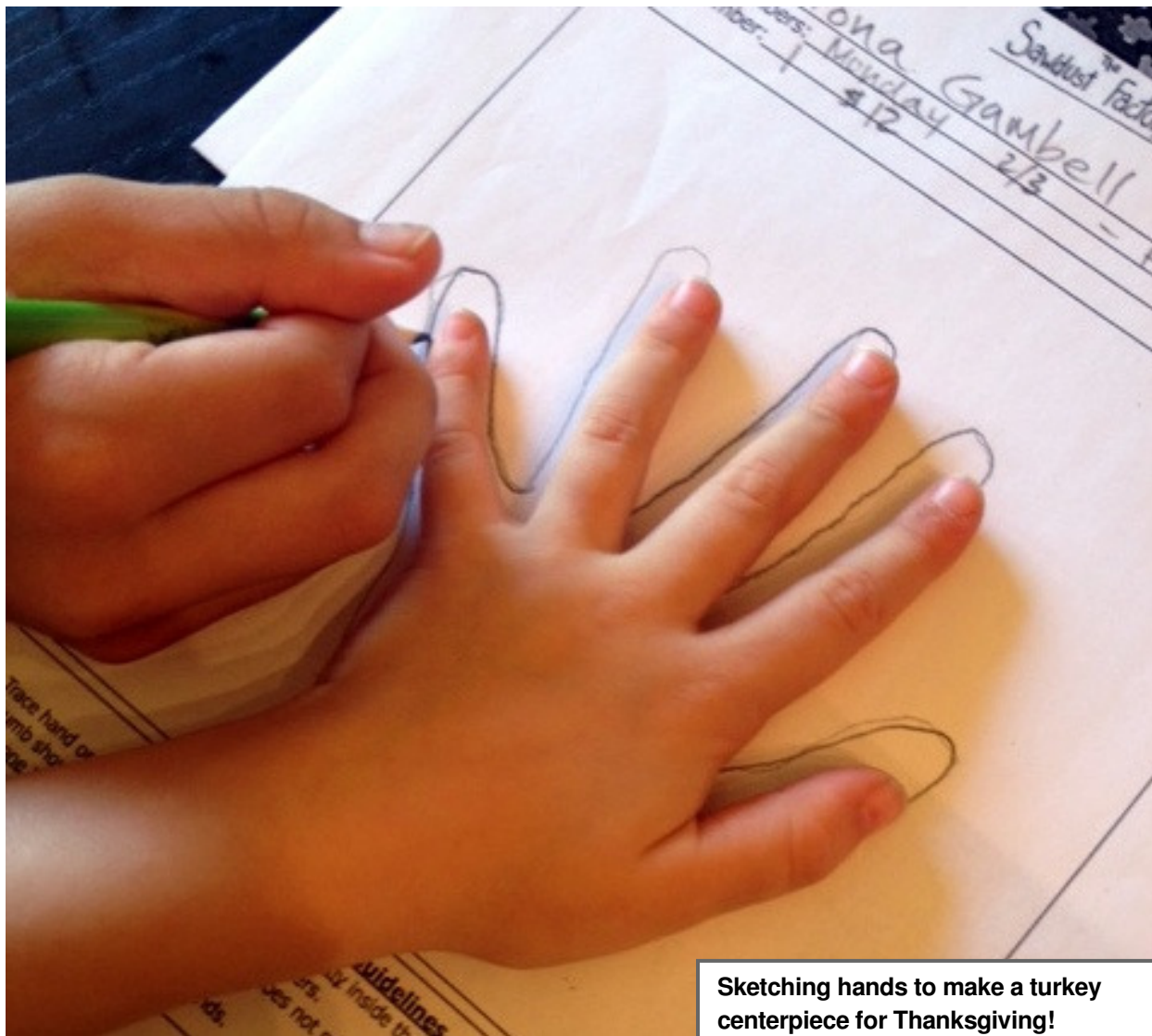
Sketching hands to make a turkey centerpiece for Thanksgiving!