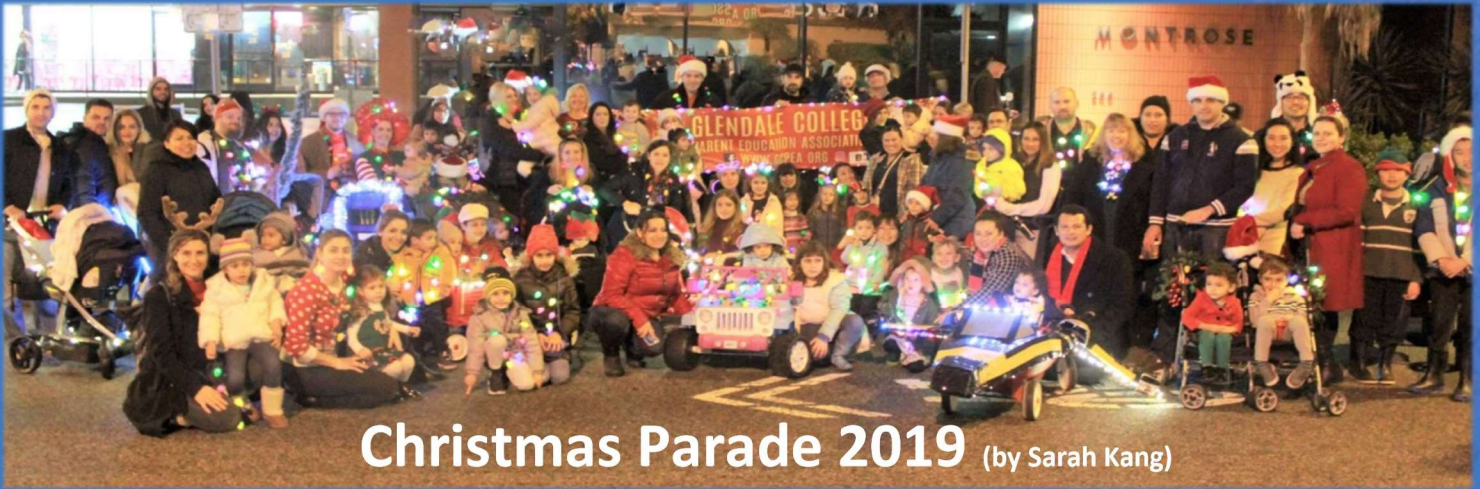
Christmas Parade 2019

On Saturday, December 7th, 2019, approximately 200 members from the program gathered together to join many other organizations from the community in the Annual Montrose Christmas Parade!